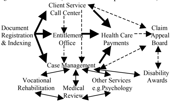
Figure 3. Workflow (After E-File Implementation)

In working with the "pilot" office, the E-File project team had anticipated these impacts, but with a very sketchy concept of how to accomplish the joint objectives of improving customer service and to "up-skill" jobs. The proposal was for the employees in a new computer-aided CSR position (now, with more immediate and accurate information) to answer many of the phone inquiries previously handled by Phone Control Clerks, plus do some of the administrative work of Case Assistants. CSRs were also to adjudicate non-complex claims previously handled by first-level Claims Officers. The multi-task nature of this proposed new role created real job design challenges.